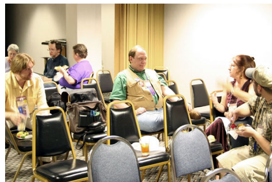
CUUPS members from around the nation meet for fellowship

The exhibit hall was not the only CUUPS presence at GA this year. There were 25 attendees at our annual meeting, with five board members present. Nominees were taken for Board elections coming up in the Fall and for the Nominating Committee. A polling committee was named and possibilities for a future CUUPS Convo were discussed.