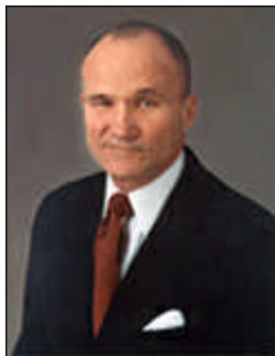
Police Commissioner Raymond W. Kelly