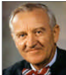
Justice John Paul Stevens

A U.S. Supreme Court justice has struck down the city of Cincinnati's OH ban against a Jewish display of the menorah on a downtown square — and all other religious exhibits — during the holiday season.