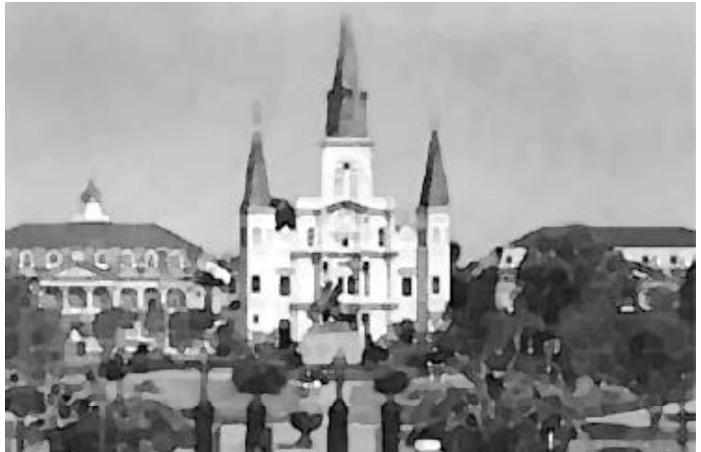
St. Louis Cathedral